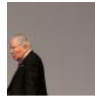
Late Japanese industrialist Osamu Suzuki, former chief of Suzuki Motor Corporation, has...