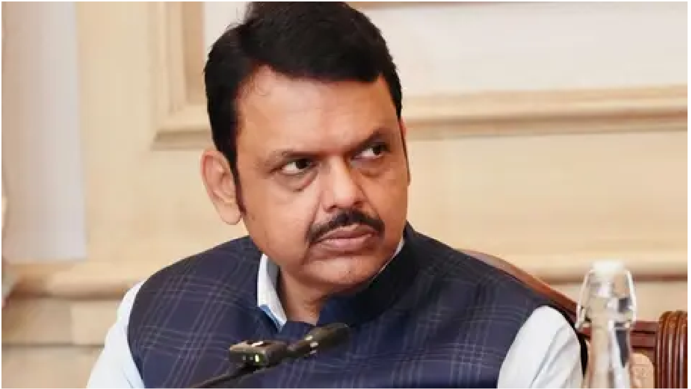
Maharashtra Chief Minister Devendra Fadnavis. File Pic