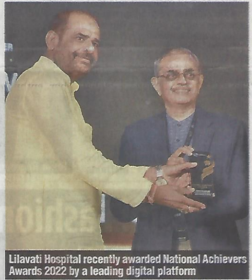
Lilavati Hospital recently awarded National Achievers Awards 2022 by a leading digital platform

Under his leadership, the hospital has followed the principles of empowerment, innovation and quality care. The executive leadership always focuses on achieving high performance and quality care. Internal audits and quality control have been the backbone in achieving such quality results. He has always encouraged academics and under his leadership Lilavati Hospital was conferred the very first "Center of Excellence" in teaching for DNB Programme by AN-